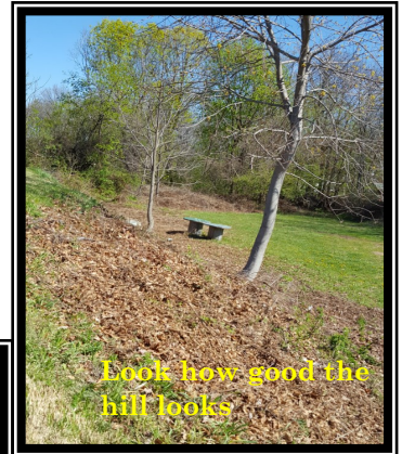
Look how good the hill looks

Thank you to all who gave their Saturday to cleanup and improve our church