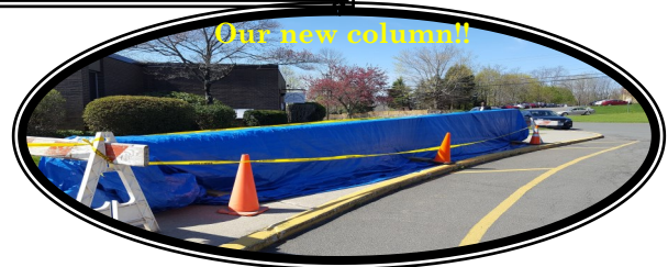
Our new column!!