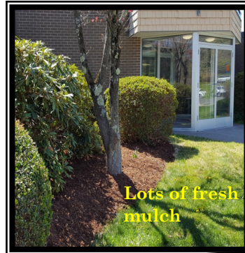
Lots of fresh mulch