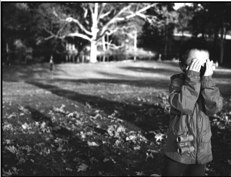
All are welcome to use this prayer and photo for the ministry of God!

Gracious and merciful God, in the midst of our lives, we call your name. When I face illogical situations and experience irrational circumstances, I cry out to you. You are just and righteous, but I am not. You are good, but I am not. You are slow to anger, but I am not. You are compassionate, but I am not. I need your help. I need you, o Lord. We need your peace which is filled with justice. So, today, I ask your Holy Spirt. Please come and touch your children. Let us know you are with us and listen to our crying. Please reveal that You are Good, Just, Righteous through Love! We are holding your Living Word, Jesus Christ. Amen!