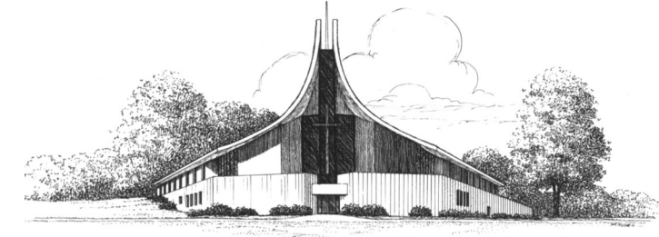
The United Methodist Church of Danbury