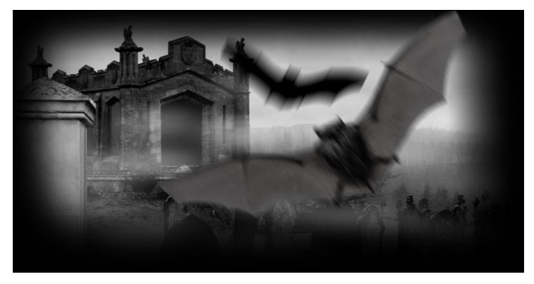
BE THERE AND BE SCARED!!!