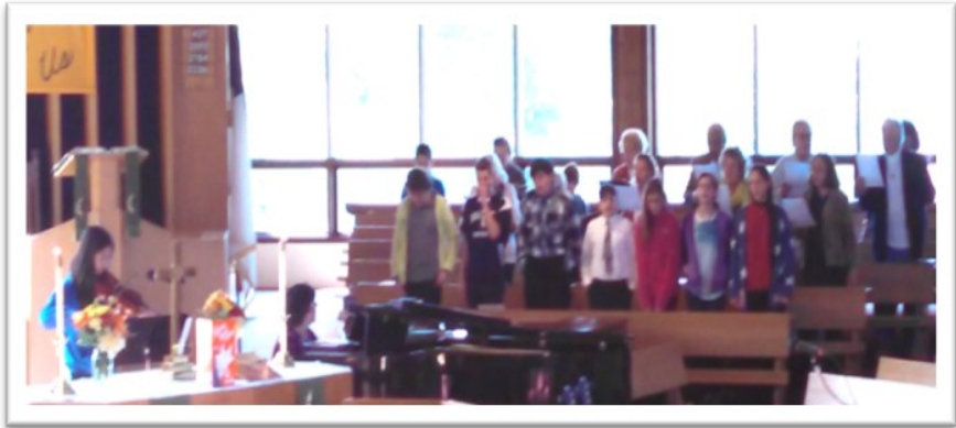
Impulse Choir and youth choir accompanied by piano and Musa on violin.