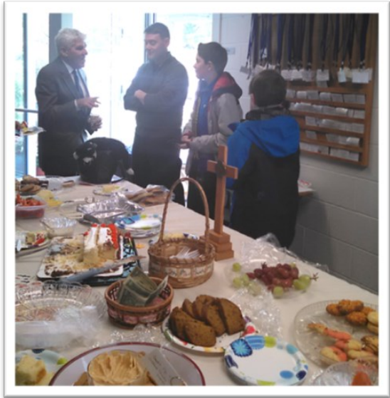
The UMW provided FABULOUS treats for our social hour after services.